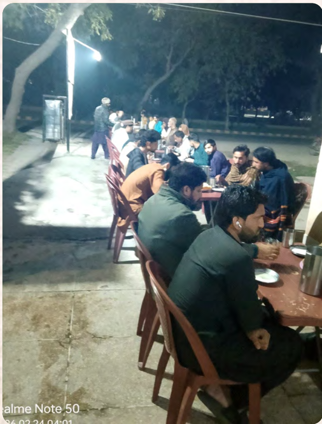
alme Note 50 26.02.24 04:01